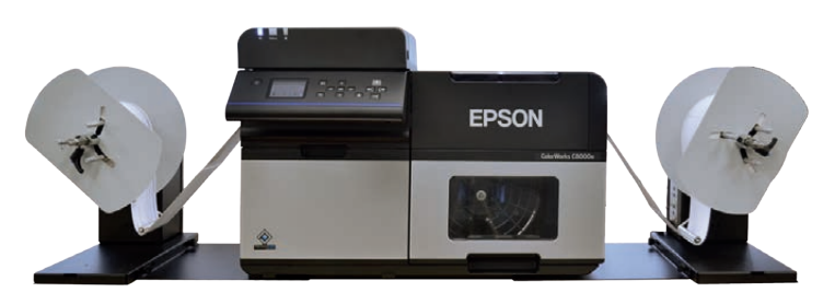
LABEL REWINDER (RW8000A) - Epson C8000 printer - LABEL UNWINDER (UW8000A) (Not included)

The Unwinding/Rewinding system for Epson C8000 Label Printer can handle media up to 127mm (5") wide and unwind/rewind label rolls having outside diameter up to 250mm (9.84").