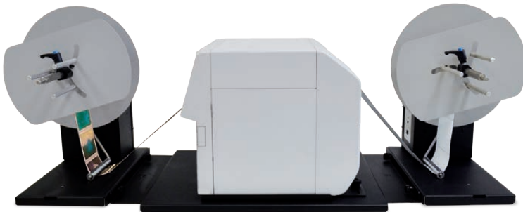
LABEL REWINDER (ASD1111-S0) - Epson D3800 printer - LABEL UNWINDER (ASS1111-S0) (Not included)

The new Unwinding/Rewinding system for Epson D3800 Label Printer can handle media up to 127mm (5") wide and unwind/rewind label rolls having outside diameter up to 250mm (9.84"). Units are equipped with a 3" or adjustable core holder from 40 to 118mm (1.57" - 4.64").