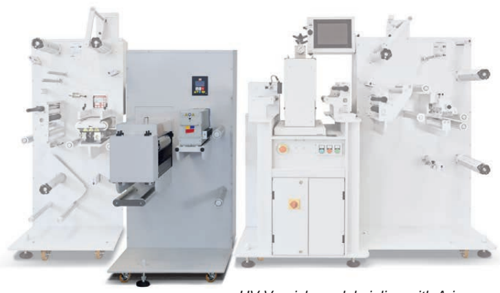
UV Varnish module inline with Aries